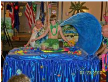
A Cool Float