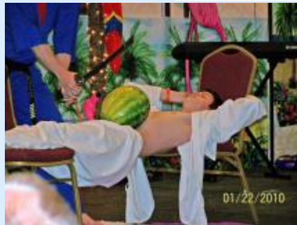
This was talent???