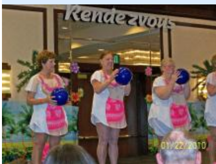
They won too!