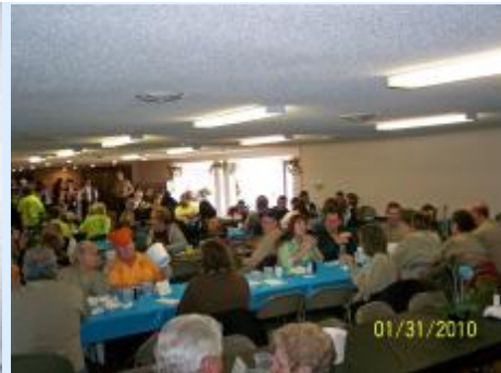
A good crowd!