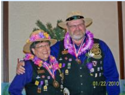
2010 Indiana Couple of the Year