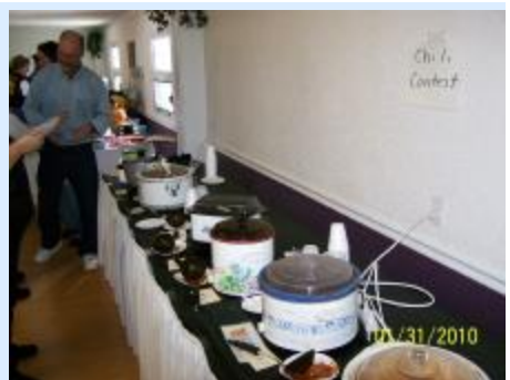
A row of Chili pots.