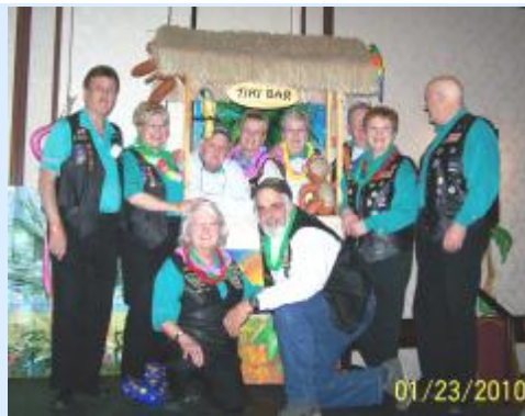
Huddled around the Tiki Bar.....