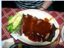
Great Ribs & Salad Bar $10.99