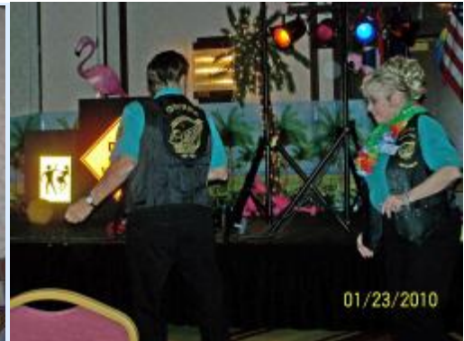
Dancing around the Palm trees! What a night!