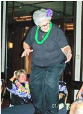
Dancing on the tables!