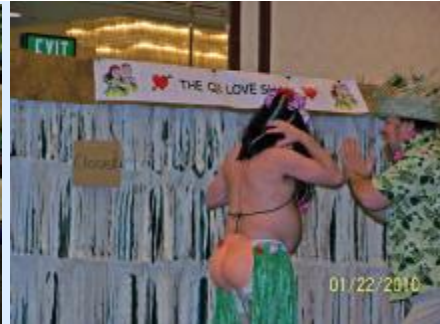
And this was winning talent!