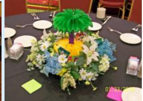
C2's Table Arrangement